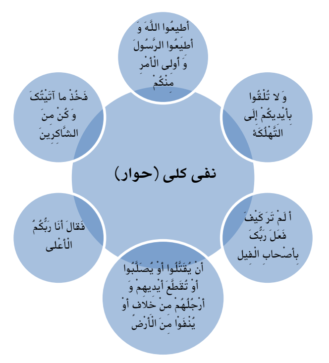
Parallel negation (absorption)

for God's blessings, received the meaning of contentment and gave it as a moral order to his son and all the readers of this book.