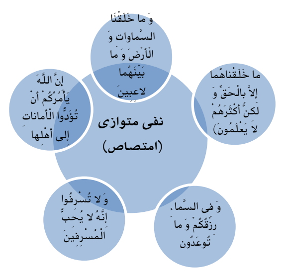
parallel negation (absorption)

This method of application is more compatible with absorption. What is the trust mentioned in this verse based on the interpretation of Muslim commentators, it has a wider scope and includes any material and spiritual capital. (Havi, 1409: 2/1088; Fazlullah, 1419: 7/314)